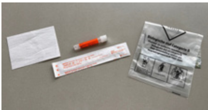
absorption sheet, tube and cotton bud, safety bag